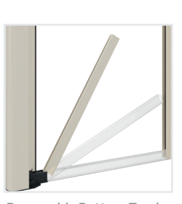
Removable Bottom Track