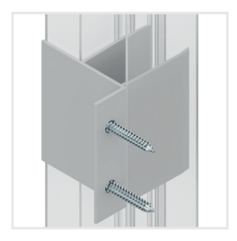
Concealed Fastening Brackets Code 382