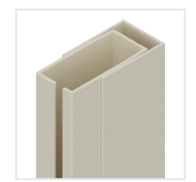
Telescopic Tracks Upon Request